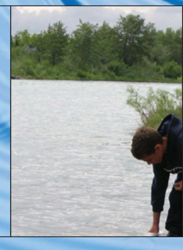
Students at University Elementary School in Calgary, gathering information for their Bow River study.

Check "AQUA FACTS" inside for explanations.