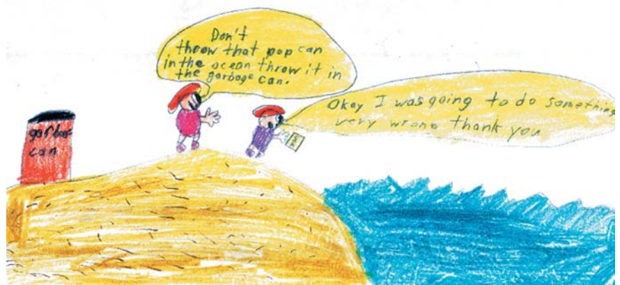
CLEAN NOVA SCOTIA by Dale / Grade 5 OLDFIELD CONSOLIDATED SCHOOL, NOVA SCOTIA