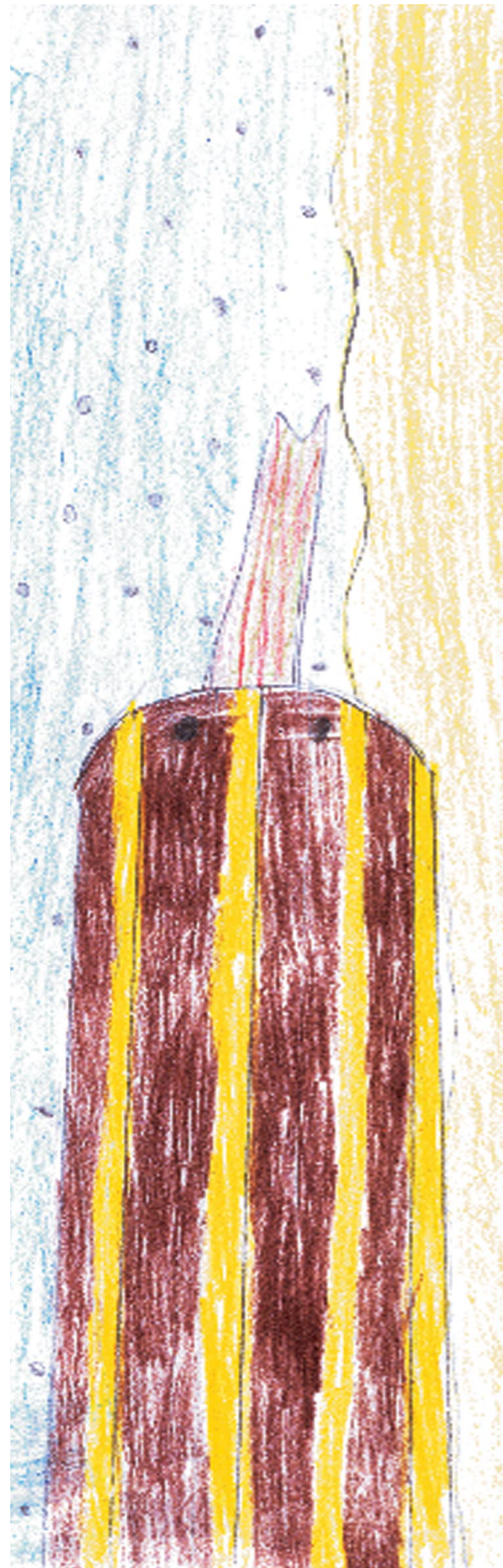
NOVA SCOTIA SPECIES by Amanda / Grade 3 MEADOWFIELDS COMMUNITY SCHOOL, NOVA SCOTIA

Environmental education programs that reach diverse or underserved communities