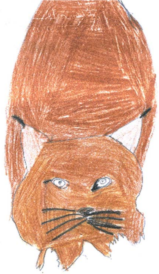
NOVA SCOTIA SPECIES by Tyler / Grade 3 MEADOWFIELDS COMMUNITY SCHOOL, NOVA SCOTIA