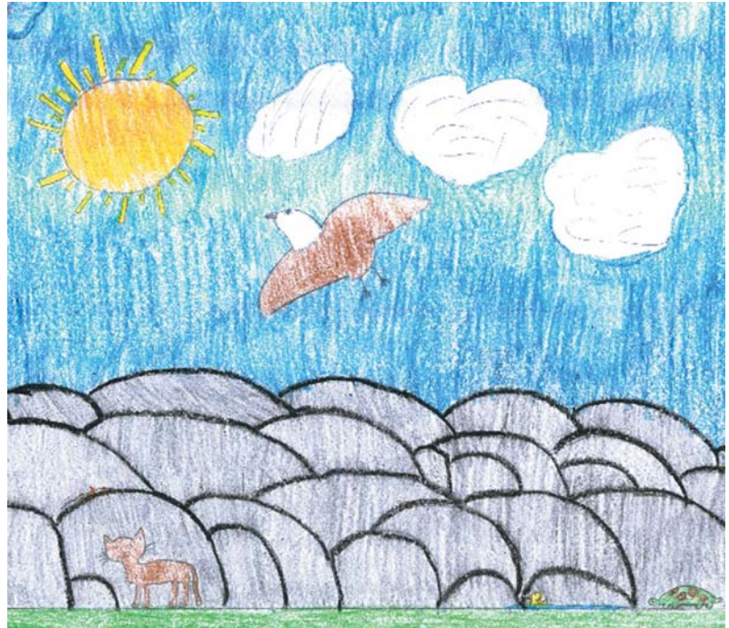
NOVA SCOTIA SPECIES by Heather / Grade 3 MEADOWFIELDS COMMUNITY SCHOOL, NOVA SCOTIA