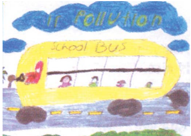
WHERE AIR POLLUTION COMES FROM by Star PLYMOUTH SCHOOL, ARCADIA, NS

Ma Rue Verte offers subsidized in-class programs for teachers across Quebec, and a Standard of Excellence for high quality EE programs provided mainly by Quebecois organizations.